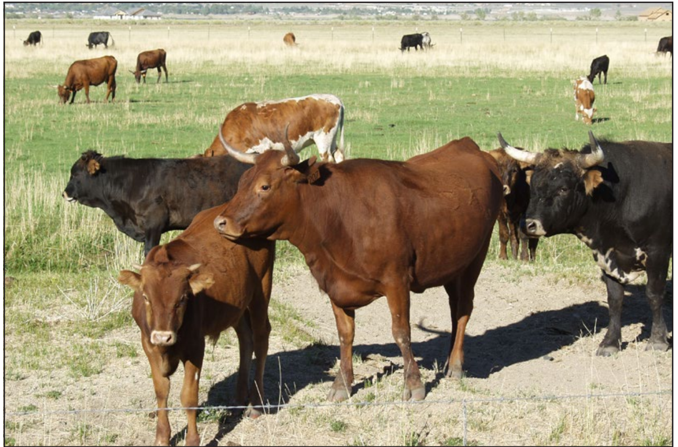
The University of Nevada, Reno will host the Cattlemen's Update Jan. 10 – 14 virtually and at various locations.