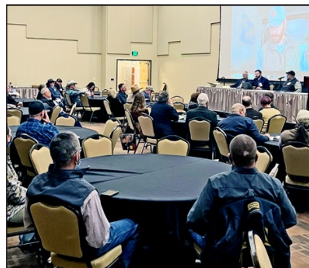
General Session: What the Heck Do They Want?

The trade show was filled this year with great businesses and agencies that support and enhance our industry. The Association would like to thank the following trade show participants: American AgCredit, American Angus Association, Bayer Environmental Science, Bison Pipe & Supply LLC, Boss Tanks, UNR College of Agriculture, Biotechnology & Natural Resources, D & S Designs, Double Bar J Cashmere, Elanco, Greenway Seed, Hygieia Biological Laboratories, Intermountain Farmer's Association, Kirby Manufacturing, Knipe Land Company, Laird Mfg.,